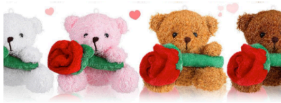
Mini Teddy Bear: $4