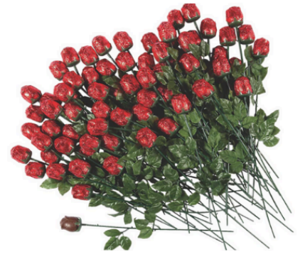
1 Chocolate rose stem: $5