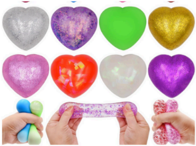
Squishy heart: $2

Circle the item you wish to purchase. All money must be attached to this slip in full. Cash only. All slips must be submitted by the end of the day 2/10. Items will be delivered on 2/12. Colors of items can not be selected.