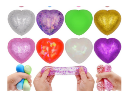
Squishy heart: $2

Circle the item you wish to purchase. All money must be attached to this slip in full. Cash only. All slips must be submitted by the end of the day 2/10. Items will be delivered on 2/12. Colors of items can not be selected.