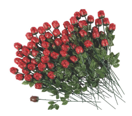
1 Chocolate rose stem: $5

Singing Gram from Honors Choir: $ 5 Please circle your <u>top 2 songs</u> and one will be performed for the student above.