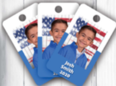
3 KEY FOBS